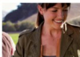
Incentives and Offers