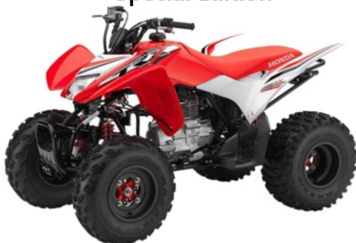
2017 Honda TRX250X Special Edition