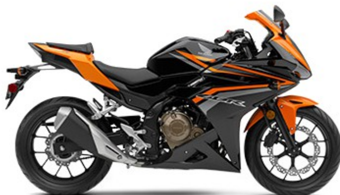
2017 Honda CBR500R