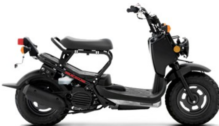
2017 Honda Ruckus